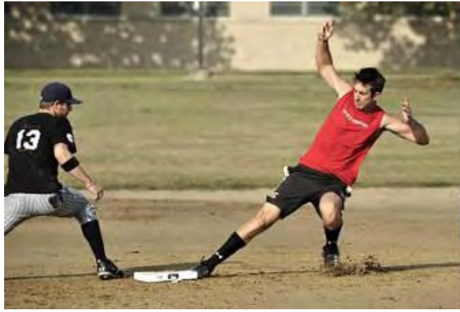
SOFTBALL- Bring your own glove