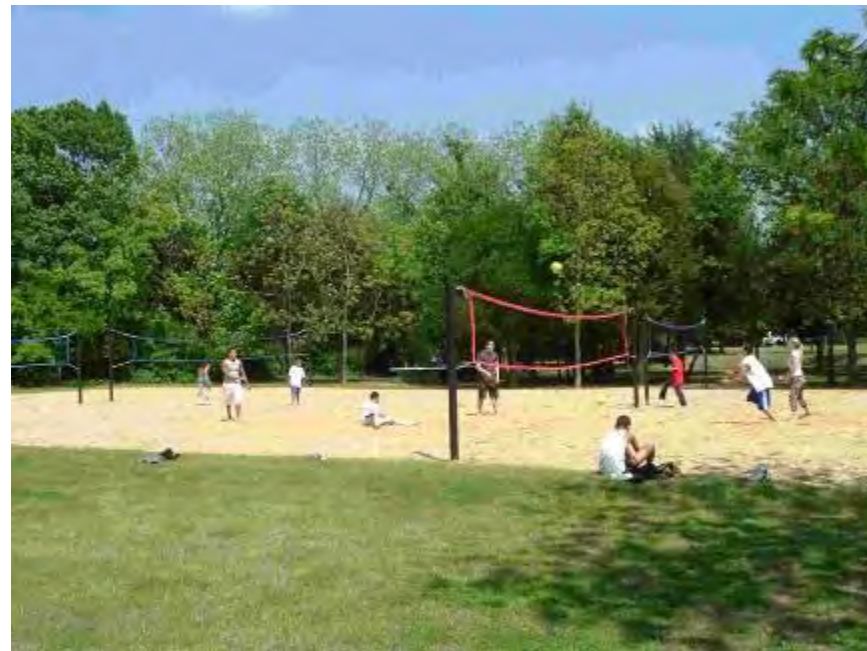
VOLLEYBALL (4 Sand Courts)