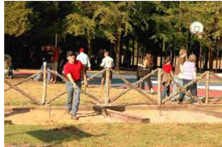
HORSESHOES (6 Pits)