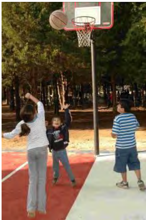
BASKETBALL (4 Half Courts)