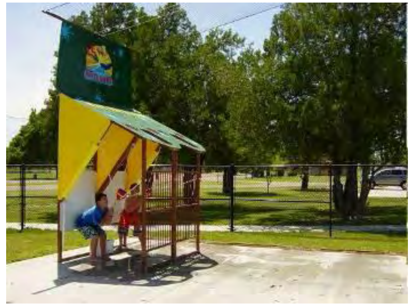
SHOWDOWN Water Balloon Launchers (1 Hour)