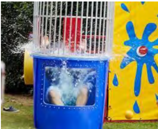
DUNK TANK (4 hours) $450.00