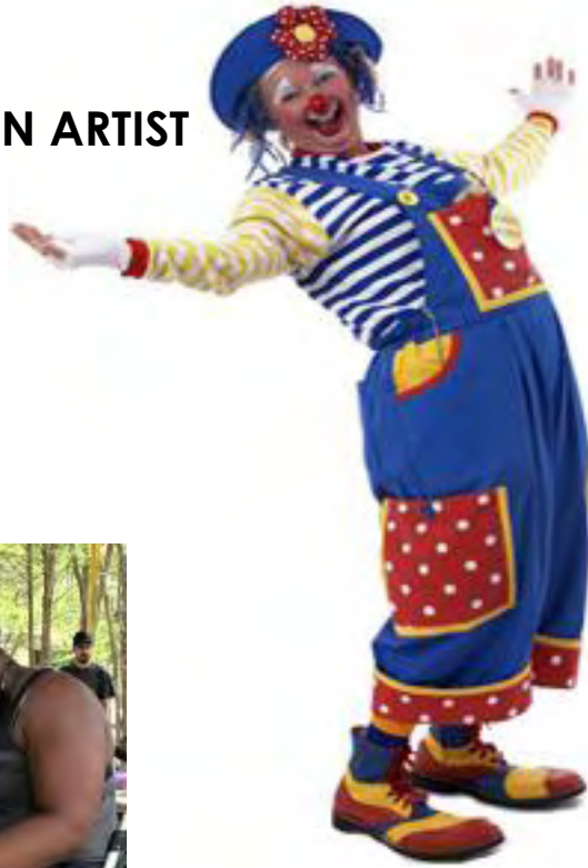
CLOWN/BALLOON ARTIST (2 hours)