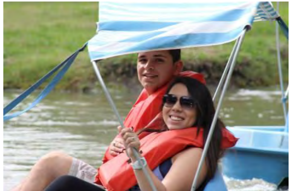
PEDAL BOATS (1 Hour) Additional hours: $200.00 per hour