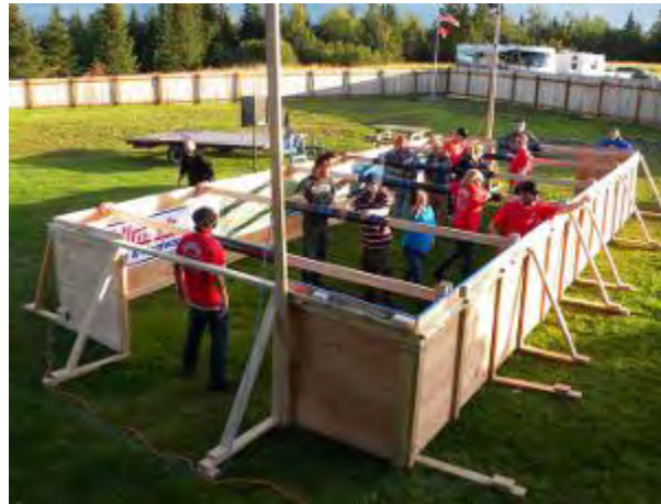
HUMAN FOOSBALL with scorekeeper/referee Priced upon request