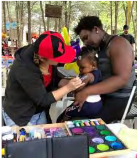
FACE PAINTER (2 Hours)