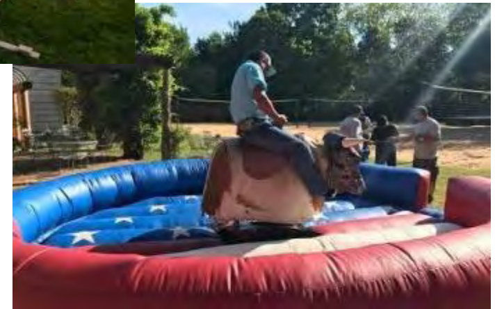
MECHANICAL BULL (4 hours) $850.00+