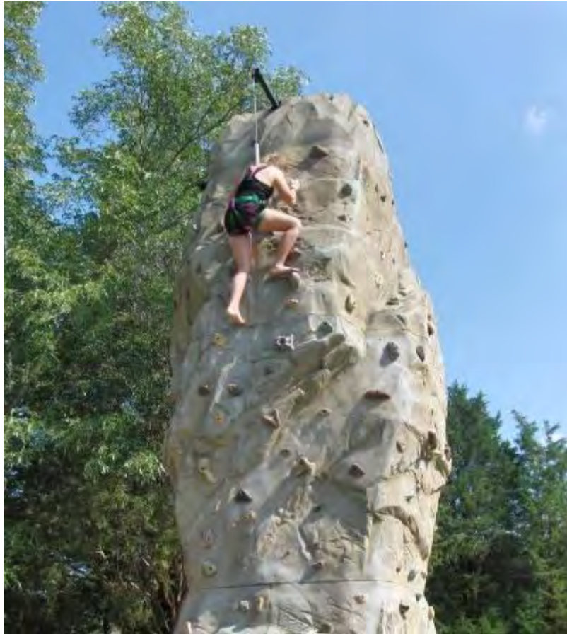
ROCK CLIMBING WALL (1 Hour) Additional hours: $300.00 per hour