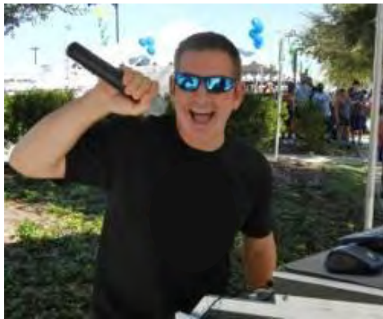
DISK JOCKEY $650.00 (4 hours, morning/early afternoon) *Saturday evening events priced upon request Want someone to lead dances, emcee games and contests, and announce when activities are opening and closing? They've got you covered!