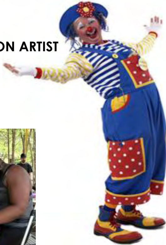
CLOWN/BALLOON ARTIST (2 hours)